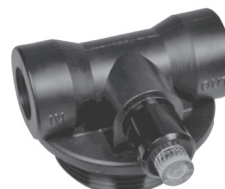
LC-MH25875S-75 WITH DI LIGHT *